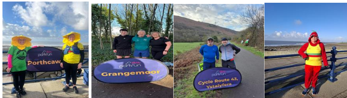
Just some pictures of Striders supporting st Davids day runs